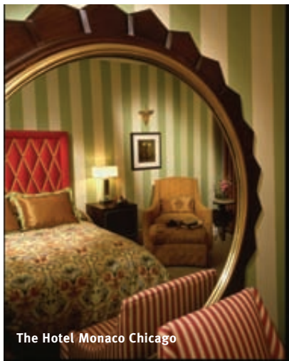
The Hotel Monaco Chicago